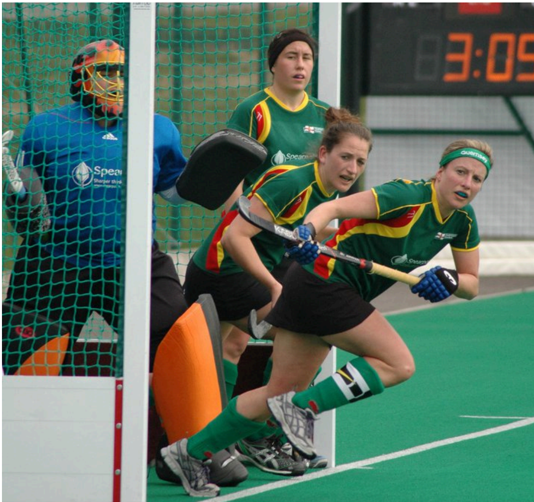
Guernsey Ladies defend a penalty corner in last season's HA Vase final.